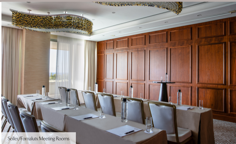
Sollert/Fornalutx Meeting Rooms