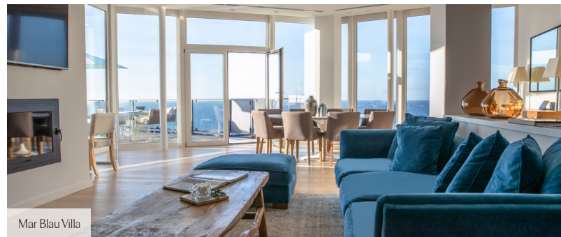
Mar Blau Villa