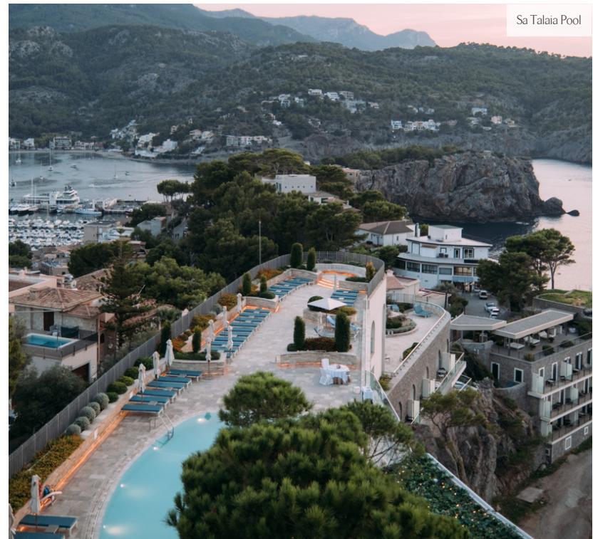
Sa Talaia Pool

There are two outdoor swimming pools, both heated and with spectacular views. The luxurious infinity pool at the top of the hotel is for guests over the age of 16. Looking toward the Port and the sea, the Sa Talaia pool is enjoyed by all ages, its blue mosaic tiles specially chosen to mirror the colour of Es Trenc beach, one of the most beautiful beaches on the island.